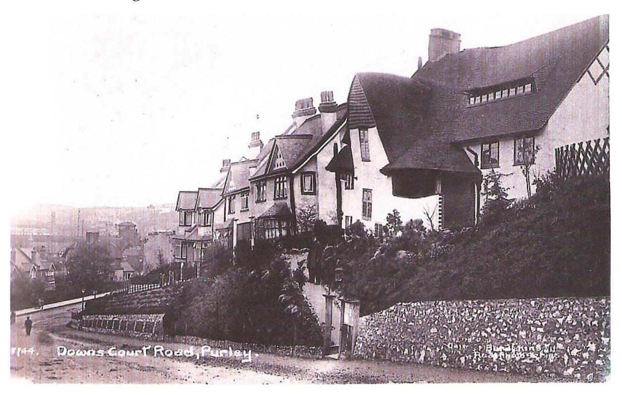
Figure 1: The meeting house as newly built, c.1909

Purley Meeting House was built in 1909, from designs by George Pepler of Pepler & Allen, at a cost of £1,600. A photograph of its original appearance is shown at figure 1 (the apparent dip in the ridge is thought to be due to the plate being moved in the camera during exposure, rather than any inherent design fault; this and the overhanging eaves almost give the impression of a thatched roof, but the building was always tiled). The main room seated 160, and had a folding screen to create a separate lobby. Butler describes the original provision for the warden as 'rather inadequate'; this part of the building was adapted and extended in 1985-8 at a cost of £60,000 (architect John Marsh of the Marsh, Eddison, Brown Partnership, London WC2, Surveyor to Six Weeks Meeting).