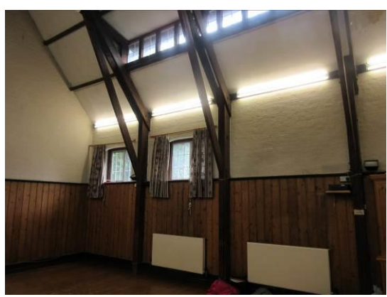
Statement of Significance

An attractive Arts and Crafts design of the Edwardian period by Pepler & Allen, notable figures in the garden city movement and the development of modern town planning. Overall, the meeting house has high significance.